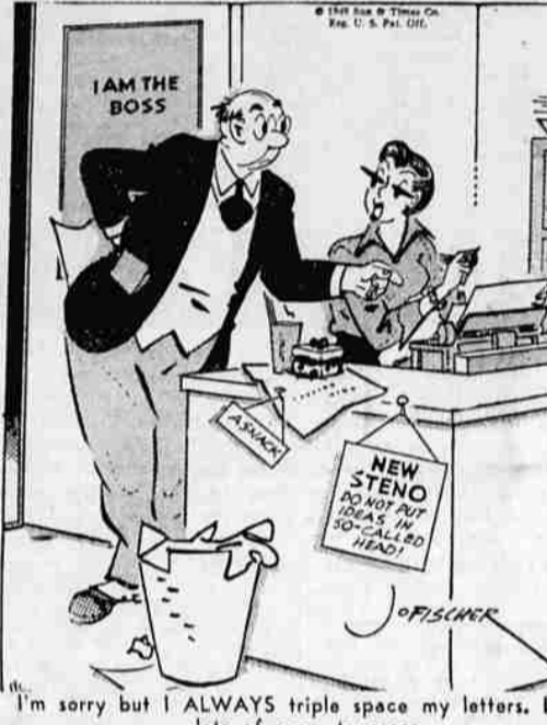
"I'm sorry but I ALWAYS triple space my letters. I need lots of room to erase."