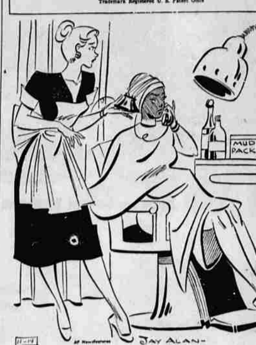
"I'll be a little late for dinner, mother, I'm getting plastered!"