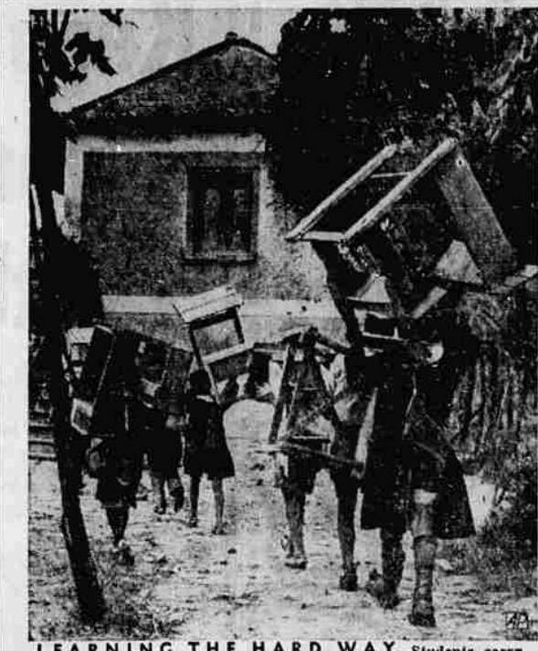
LEARNING THE HARD WAY—Students carry desks into country school (background) near Torrice, Italy, about 56 miles southeast of Rome.