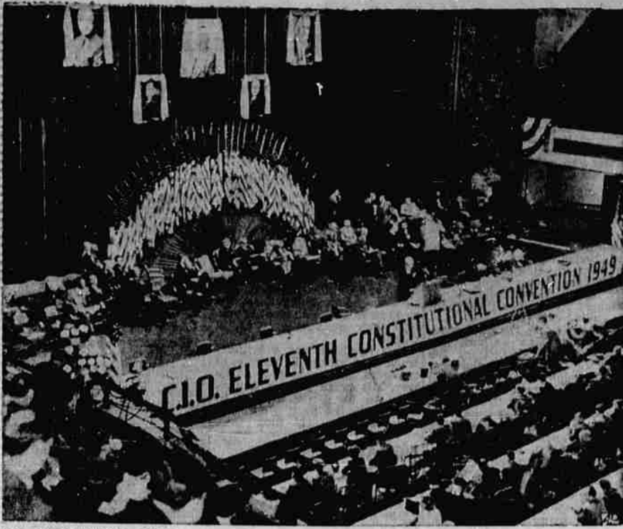
CIO CONVENTION OPENS — At Public hall, Cleveland, O., the CIO opened a week-long convention of some 800 delegates. A move by the right-wing majority to discipline CIO left-wing unions promises to make the meeting one of the most important in the history of the big industrial union federation.