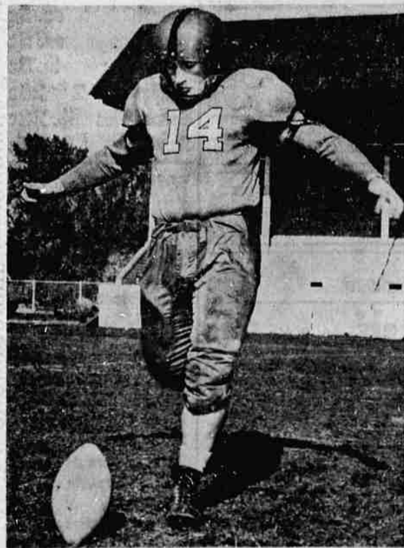
ROSEBURG INDIANS VS. GRANTS PASS CAVEMEN