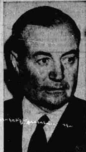
NEW NAVY BOSS — Vice Admiral Forrest P. Sherman, above, appointed to succeed Admiral Louis E. Denfeld, ousted as chief of Naval operations.

The Weather Fair this afternoon, tonight and Thursday, except for morning fog. Sunset today 5:04 p. m. Sunrise tomorrow 6:50 a. m.