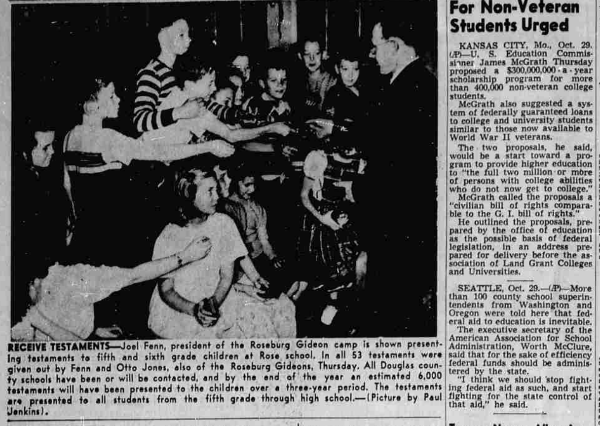
The News-Review, Roseburg, Ore .- Sot., Oct. 29, 1949