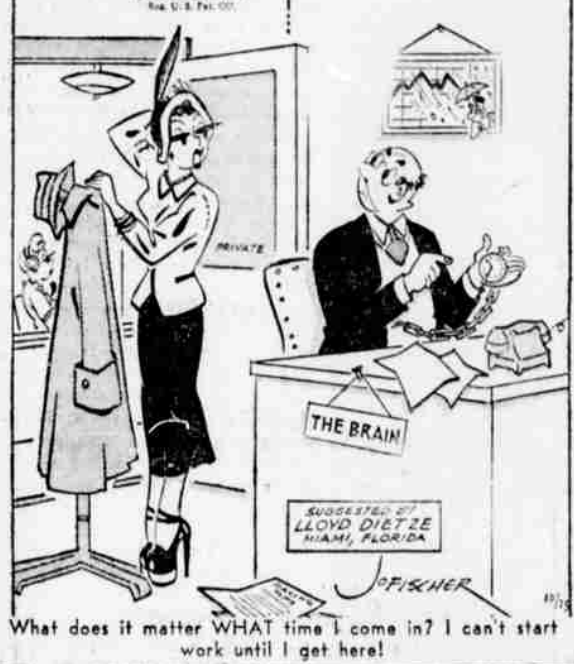
What does it matter WHAT time I come in? I can't start work until I get here!