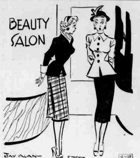
YOU DON'T NEED TO GO IN THERE TO GET YOUR HAIR CURLED; I JUST HEARD SOMETHING THAT WILL DO THE JOB RIGHT HERE! //