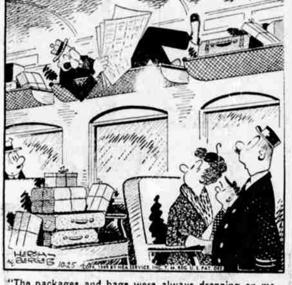
"The packages and bags were always dropping on me, so I traded places!"