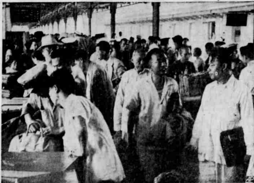
A JUMP AHEAD OF REDS —Chinese who fled Canton ahead of the Communists are shown on arrival in Kowloon railway station in the British colony of Hong Kong, Oct. 14. Reds walked unopposed into Canton that very night.—(AP Wirephoto).

In short Nehru aims at combining what he regards as best in both systems.