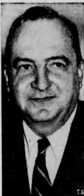
ARMS AID HEAD —James Bruce (above), former Ambassador to Argentina, was nominated by President Truman to head the $1,314,010,000 foreign military assistance program.

There are 500 flowering plants, including the grasses, in Mount Rainier National Park, Wash.