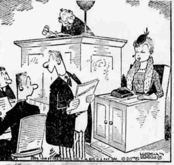
It's a now witness chair, designed to keep the jury's mind on the testimony!