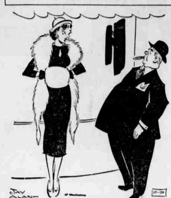
I'M AWFULLY TIRED OF THOSE SIXTY DOLLAR DINNERS, MR. GLOOP, CAN'T WE EAT AT A HOT DOG STAND JUST FOR A CHANGE?