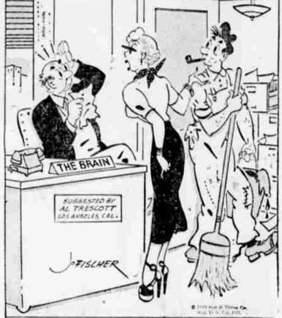
I knew I hadn't lost that letter, Mr. Wump. The janitor just found it when he swept back of the files.