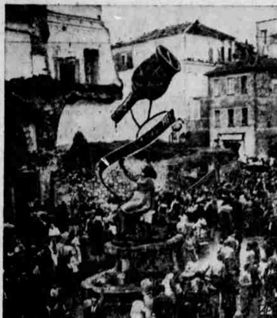
FREE WINE AT GRAPE FETE — From this fountain flowed more than 1,000 gallons of wine during the annual grape festival at Marino, Italy, wine-producing center near Rome.