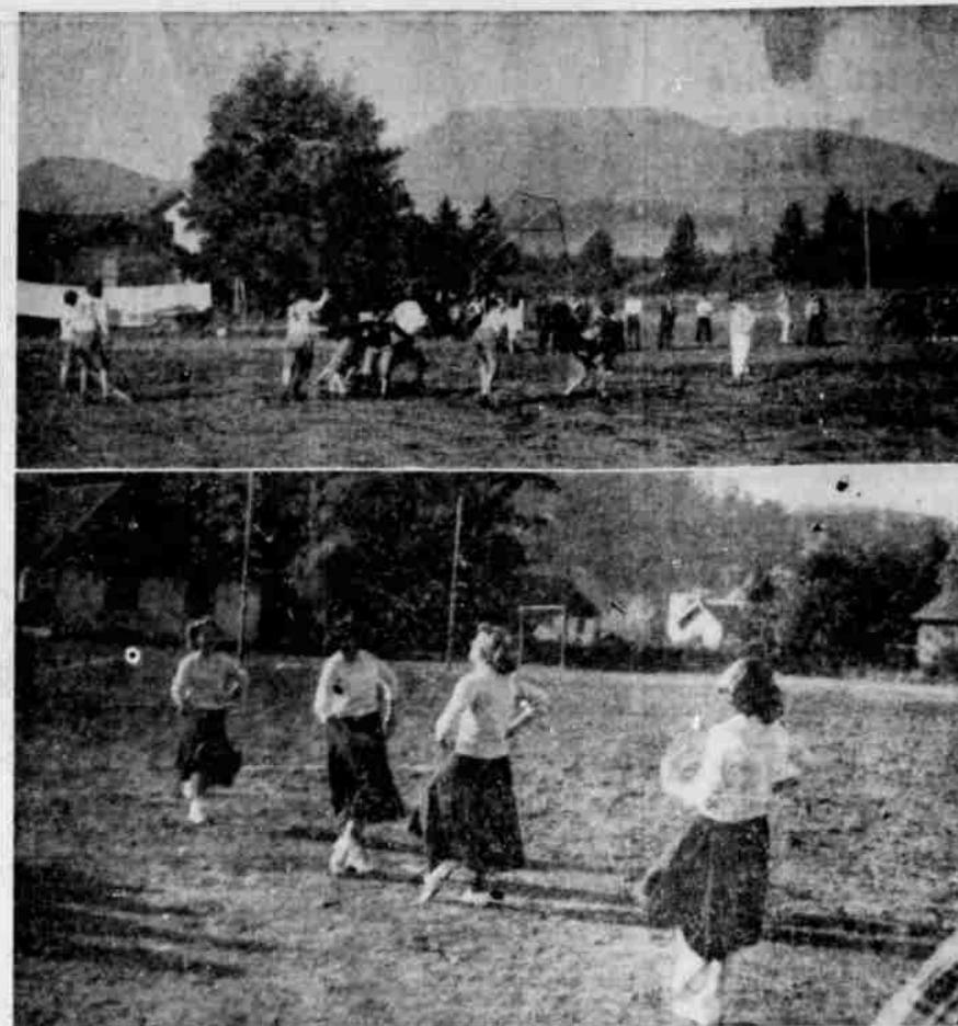
GLIDE THUMPED BY OAKLAND —Top picture, Oakland romps through Glide's defense for more yardage as they whipped their hosts 33-6 Thursday at Glide. Lower picture, Glide yell squad tries to raise the spirits of the partisan rooting section but to no avail.—.