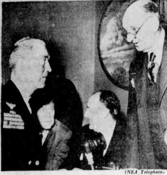
ADMIRAL FLAYS B-36—Adm. Arthur W. Radford (right), Pacific Fleet commander, is greeted by Rep. Carl Vinson (D, Ga.), chairman of the House Armed Services Committee (left), as he arrived to testify before the committee in Washington. Adm. Radford told the congressman that the Air Force's B-36 bomber is a "bad gamble with national security" and would be "useless defensively and inadequate offensively" in an atomic war.