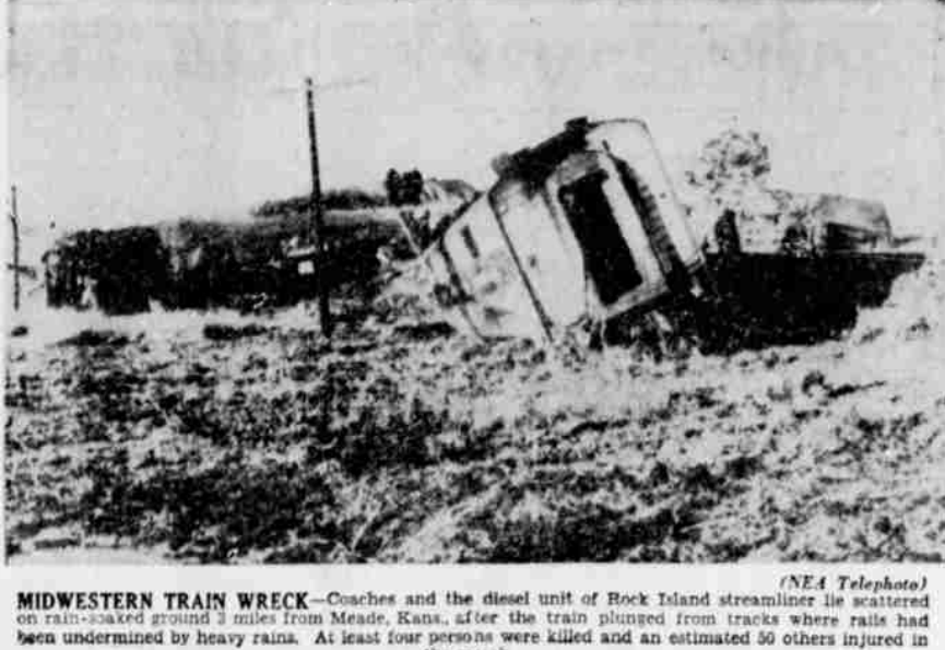
MIDWESTERN TRAIN WRECK—Coaches and the diesel unit of Rock Island streamliner lie scattered on rain-soaked ground 3 miles from Meade, Kans. after the train plunged from tracks where rails had been undermined by heavy rains. At least four persons were killed and an estimated 50 others injured in the wreck.

PRODUCE PORTLAND, Oct. 12.—(AP)—Butterfat—Tentative, subject to immediate change: Premium quality maximum to .35 to 1 per cent acidity delivered in Portland, 63-66c; first quality, 61-64c; second quality, 57-60c. Valley routes and country points 2c less than first.