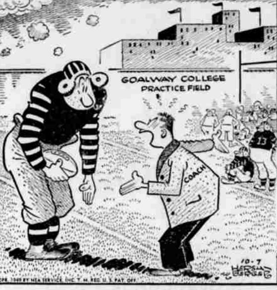
"You numbskull—there was a hole at tackle big enough for you to drive your truck through!"