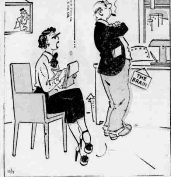
Please stop being mad, Mr. Wump. How can I take dictation if you're not speaking to me?