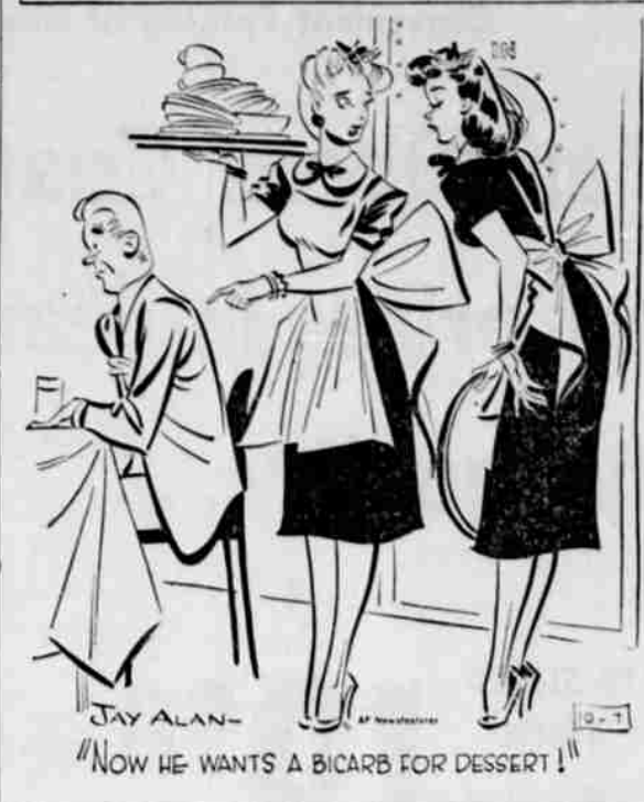
Now he wants a bicarb for dessert!