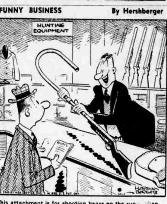
"This attachment is for shooting bears on the run... when you miss on your first shot!"