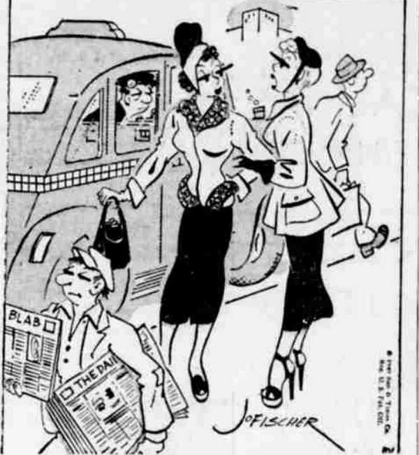
No, no... not THAT color cab, hysteria. It doesn't go at all with what I'm wearing!