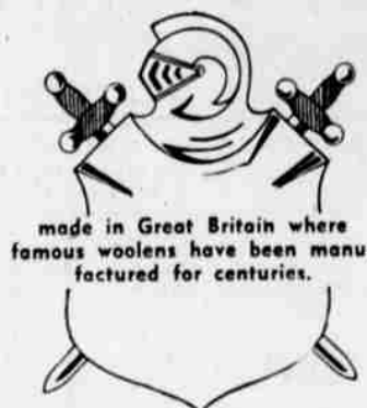
made in Great Britain where famous wools have been manufactured for centuries.

double breasted stylings made for men who want the best