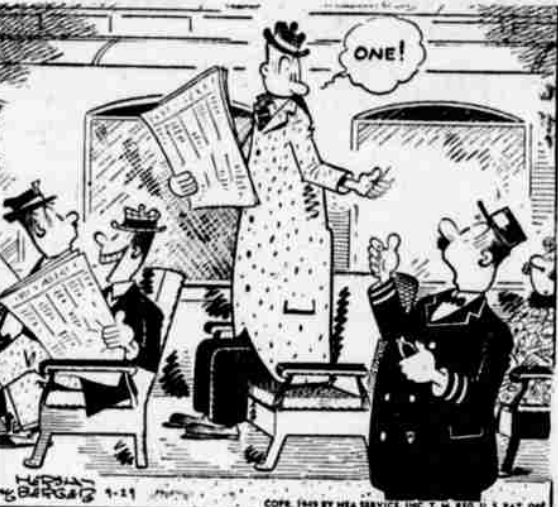
"That vaudeville balancing team always keeps the conductor guessing!"