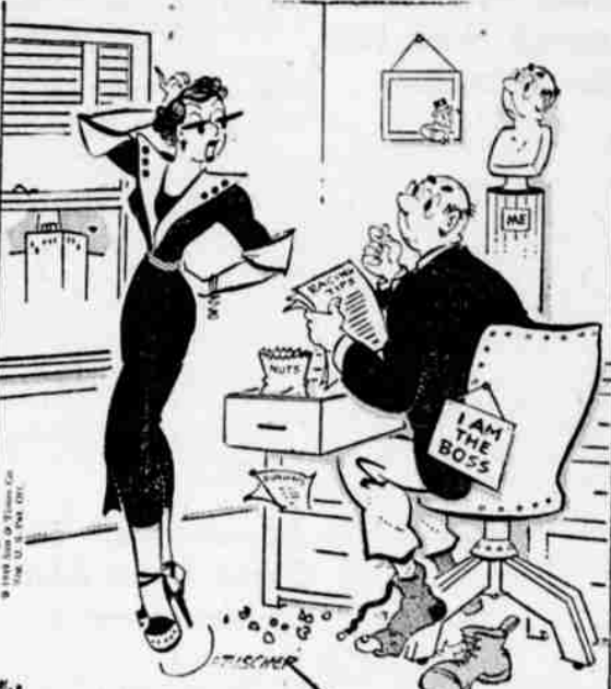
"I'm giving you two week's notice, Mr. Wump... but if I don't find a better job, you can cancel it."