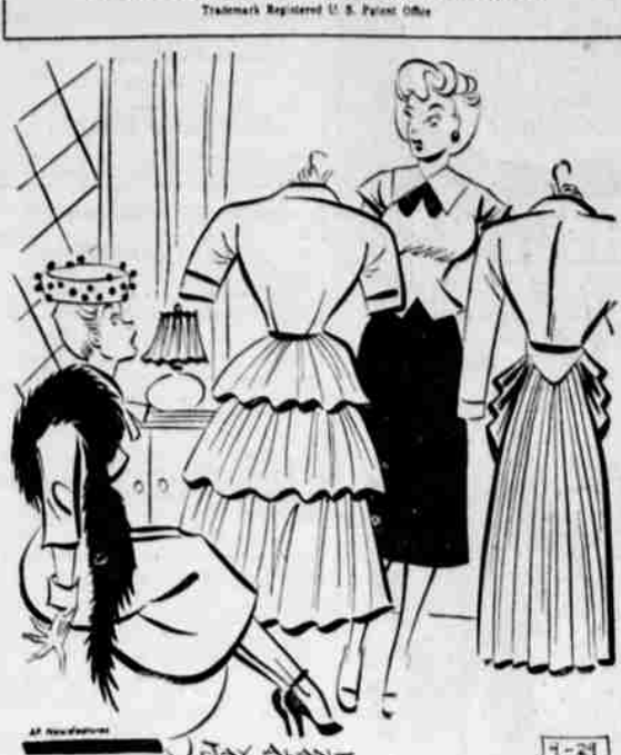
"Do you want these? I only wore them once, but I didn't have a good time in them!"