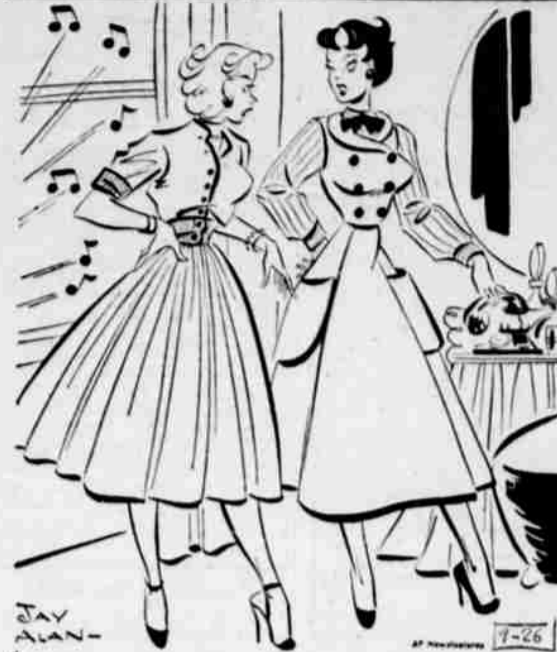
HE SAYS IT ISN'T HIS RADIO THAT'S MAKING ALL THE NOISE, IT'S HIS TELEVISION SET AND AT LEAST WE DON'T HAVE TO LOOK AT IT.

Trademark Registered U. S. Patent Office