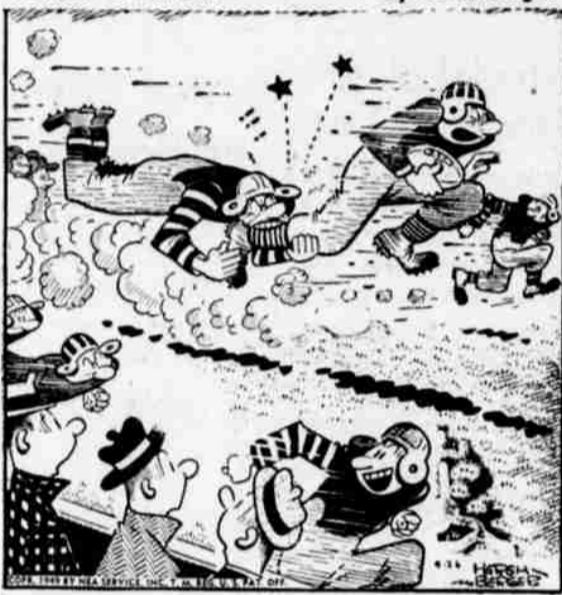
"We'll go places with his tacklas this year—he was practicing on drumsticks all last summer!"