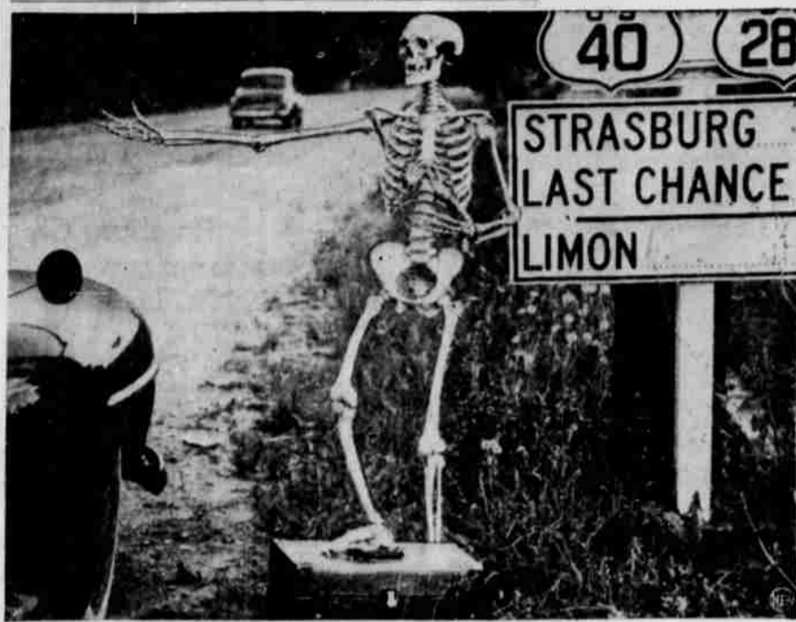
HITCHHIKER WITH A MESSAGE —Motorists near Denver, Colo., slow down perceptibly when they pass this hoary hitchhiker. The Rocky Mountain News posted the traveling skeleton for just that purpose—to give drivers a slight chill and a grim warning to be careful on highways.

Before you buy—see the SPARK GAS-MAKING DEMONSTRATION