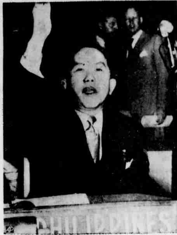
CALLS FOR 'PEACE ASSEMBLY' —Brig. Gen. Carlos P. Romulo of the Philippines gestures as he speaks at the United Nations general assembly at Flushing Meadows, N. Y. A few moments later he was elected as president of the assembly. Romulo immediately challenged the 59 delegations to make this assembly "the peace assembly."

News-Review Classified Ads bring best results. Phone 100.