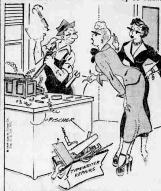
You found chewing gum, mascara and six hairpins? My... how could a few little things like that stop a typewriter from working?