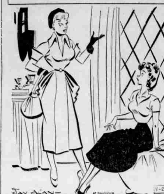
NATURALLY, MOTHER, YOUR CLOTHES AREN'T TOO OLD FOR ME BUT MINE ARE ENTIRELY TOO YOUTHFUL FOR YOU!