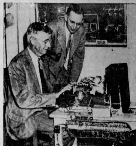
TIME SAVER —Dr. Vannevar Bush (seated) and Dr. Samuel Caldwell of the Massachusetts Institute of Technology in Cambridge, demonstrate an automatic typewriter that photographs lines of type on film—which in turn can be used to make a printing plate. The whole process takes only five minutes and is expected to revolutionize the printing industry. The device is three times faster than the conventional typesetting machine.

Thurs., Sept. 22, 1949—The News-Review, Roseburg, Ore. 5