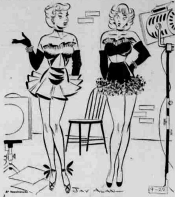
IT'S NOT WHAT HOLLYWOOD WILL DO TO YOU, IT'S WHAT YOU'LL DO TO HOLLYWOOD THAT I'M WORRIED ABOUT.