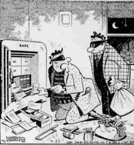
"I don't like to tell anyone how to run their business—but they've got too many I. O. U.'s in the cash box!"