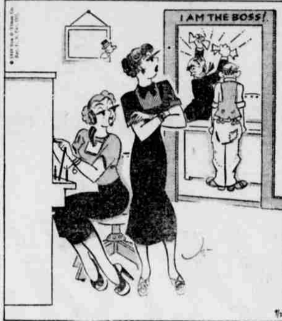
I wouldn't say he exactly loses his temper... it's ALWAYS around when he's mad.