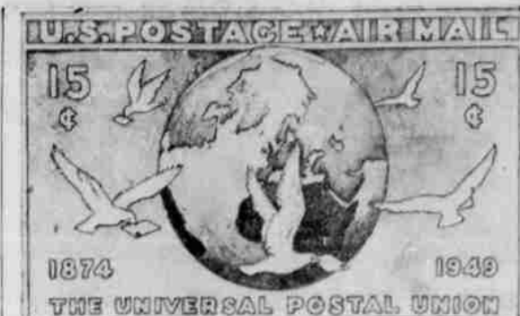
NEW AIR MAILER —A new 15-cent air mail stamp will commemorate the 75th anniversary of the Universal Postal Union. Central design shows the world being encircled by message-carrying doves in flight. The stamps will be placed on first-day sale at Chicago, Oct. 7, in connection with the annual convention of the American Air Mail Society.

The matter arose several weeks ago when a Negro war veteran was refused burial in the new cemetery because of restrictions in deeds to cemetery lots which provided that the cemetery be used for Caucasian interment only. Since that time the restrictive clause has been deleted from lot deeds, but the city and a cemetery committee, trying to work out the problem of Negro burials, hit upon the plan of allocating 72 lots in a certain portion of the cemetery for non-Caucasians. It is this plan NAACP is protesting. Mayor Bob Thompson told Edder the council was still studying the matter for several years on his large ranch near Hollywood.