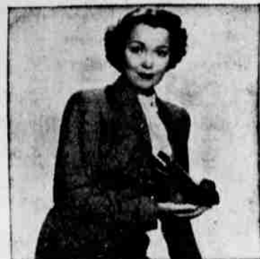
Jane Wyman, enchanting star of "The Lady Takes a Sailor," a Warner Bros. Production, gets a Hollywood preview of the smart young shoes millions of American women will choose, this season.