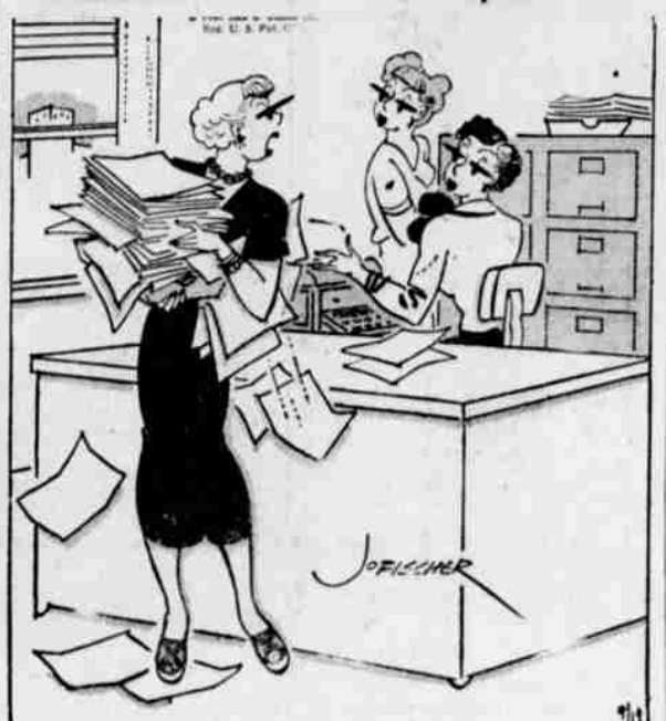
Have you an empty drawer I can hide this in, Hysteria? My own desk is SO stuffed . . . with last week's work