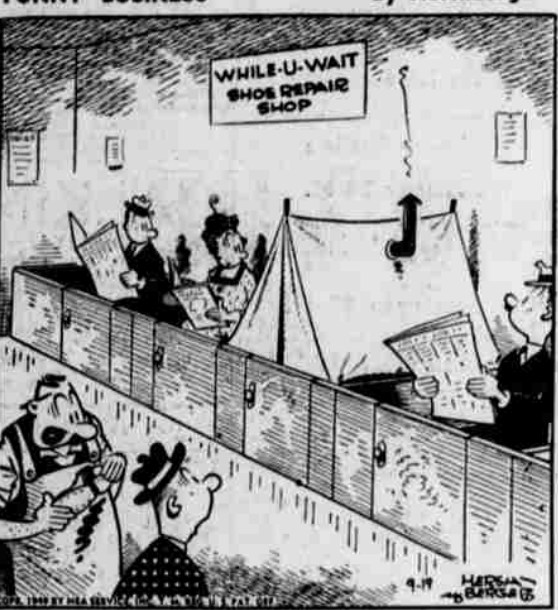
"Housing shortage—one of the customers decided to stay!"