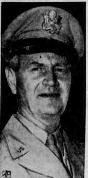
CHIEF IN EUROPE —Gen. Thomas T. Handy, formerly in command of the Fourth Army, succeeds Gen. Lucius D. Clay as commander-in-chief of United States forces in Europe.

FOR SALE 16" Stabwood Sawdust Planer Ends Johnson Fuel Co. PHONE 366-JX-5