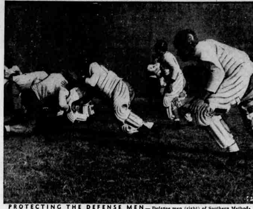
PROTECTING THE DEFENSE MEN - Defense men (right) of Southern Method-ist football squad are equipped with protective padding for daily scrimmages at Dallas, Texas.

SALEM, Sept. 14-(P)-The leg- censed and regulated.