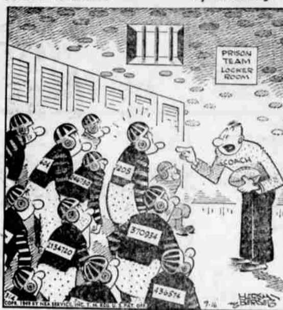
"And you, quarterback—don't get the players' numbers confused in calling signals!"