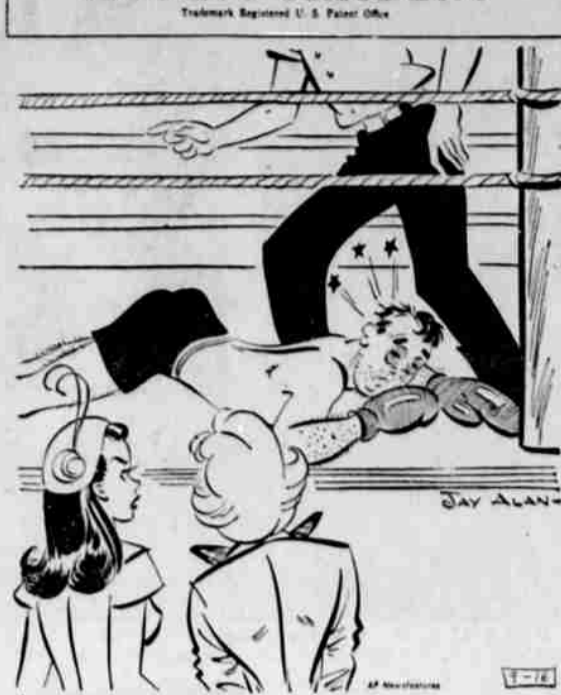
LOOK, BUTCH, I TOLD YOU TO WAIT UNTIL AFTER THE FIGHT TO GO OUT, AND WE'D GO OUT TOGETHER!