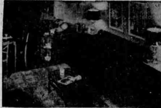
This attractive one-room apartment is the result of wise planning and the careful selection of furnishings. The arrangement of the sectional bookshelves on either side of the smart full-size sofa-bed, provides space for twin reading lamps, books, radio, and accessories on the living-room side and for chairs and serving accessories in the dining corner. The extension dining table can double as a bridge table, and, of course, the dining chairs may be utilized when additional seating space is needed.

EUGENE, Sept. 14.—(AP)—Stored water in the Cottage Grove and Fern Ridge reservoirs will be released beginning Sept. 15, the army engineers have announced. The expected withdrawal of water from Fern Ridge will raise the level of the Long Tom channel about five feet. Storm conditions may increase the depth. After the stored water is withdrawn to the prescribed minimum pool level, normal flood control will be adhered to, and this operation will cause variable stages of water in the Long Tom. Water drawn from Cottage Grove lake will cause a rise in the Coast Fork of approximately three feet. The engineers advise persons having pumps in the river to remove them.