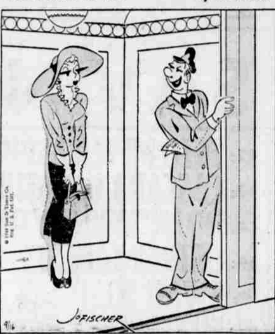
Step forward in the car, please.