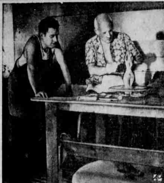
PICASSO TURNS TO CLAY —Pablo Picasso (right), famous Spanish artist, models a statue in clay as a workman looks on in a pottery factory at Vallauris, French Riviera.