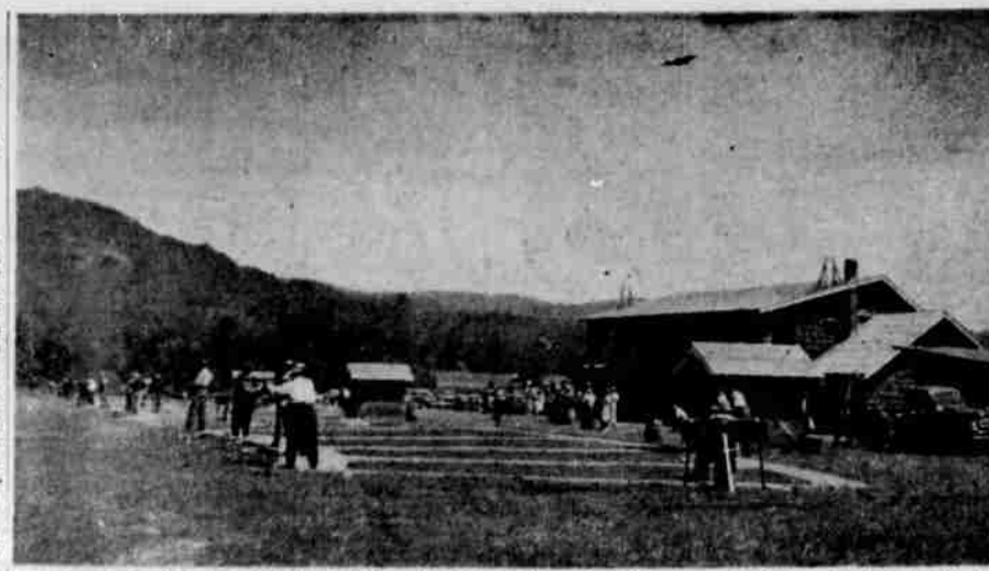
CLUBHOUSE TO BE DEDICATED —Pictured above is the new clubhouse to be dedicated Sunday, Sept. 18, by the Cottage Grove Rod and Gun club. Mayor Al Flagel of Roseburg will join with other mayors of nearby towns in the dedication program. State Game Director Charles A. Lockwood will be the principal speaker. A large delegation from the Roseburg Rod and Gun club is expected to attend the dedication and to participate in the 16-yard and handicap shoot during the morning hours.

The defendants are accused of conspiring to advocate forcible overthrow of the U. S. Government.