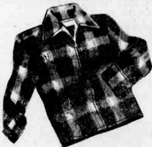
WATER REPELLENT DUCK CRUISER JACKETS

For lots of protection against the winter days ahead, this is the most popular one of them all. Heavy wool cape and double back that gives you double protection. Game pockets in back and two front pockets. Blue and red plaids. Sizes 36 to 44. 14.75