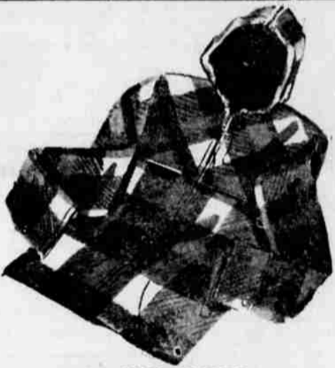
BOYS' HOODED WOOL CRUISERS

Swing that ax! It's easy in Penney's chopper jackets. They're roomy. Give you freedom of movement yet provide plenty of warmth. (An extra cape of 100% wool plaid across your chest, and back does the trick.) Red, brown and green plaids.