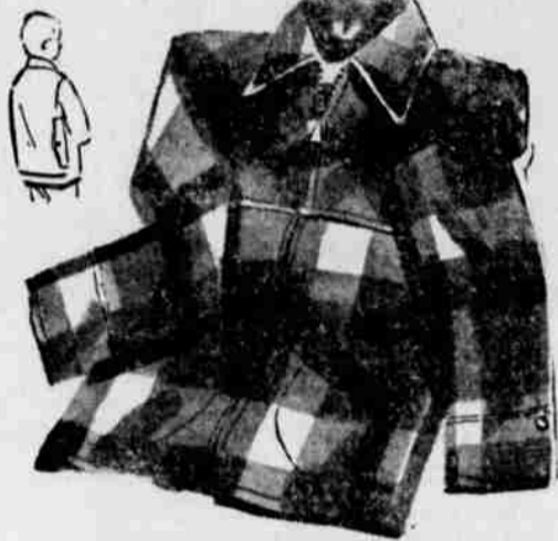
BOYS' ALL-WOOL CHOPPER JACKETS

Shop Penney's for your outdoor clothing, now at the beginning of the Fall season! Check our windows, come in and browse around, try on the many new styles and patterns, compare the quality. You'll agree that it's thrifty to shop at Penney's. Buy your outdoor clothing on Penney's convenient lay-away plan.