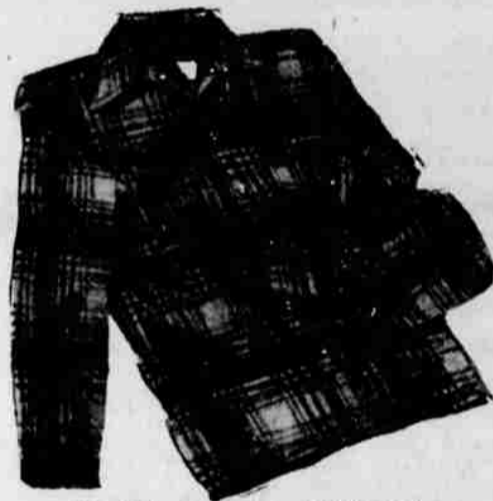
100% WOOL MEN'S CHOPPER JACKETS

Lots of protection from colder days ahead. All-wool double back cruiser with matching hood attached. Zipper front closing. Sizes 4 to 10. 7.90