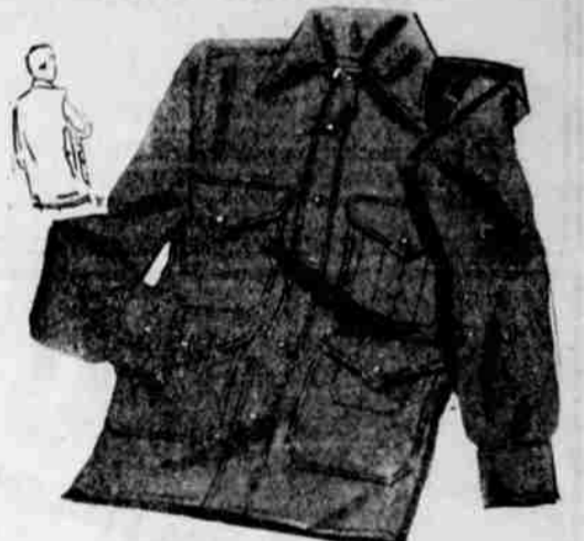
ALL-WOOL WHIPCORD CRUISERS

Heavy duck water repellent pants that are double thickness to below the knees. These pants are built for lots of wear. Treated to make them water repellent. Sizes 30 to 42.