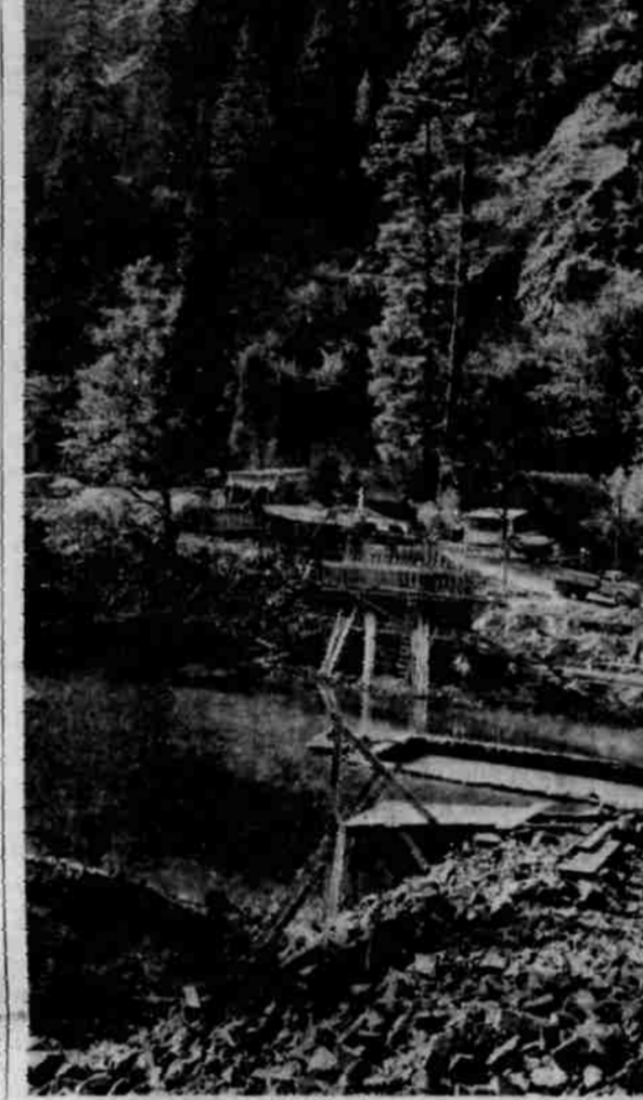
NEW BRIDGE AT STEAMBOAT—Recent view of concrete-and-steel bridge over Steamboat creek, on the North Umpqua highway, shows coffer dam in midstream, where center pier has since been constructed. This view was taken on upstream side of Steamboat creek, which flows into the North Umpqua river just to the left of this picture. On the far side is site of old Steamboat guard station.

Traffic is expected to move over the new Steamboat creek bridge this fall. The concrete-and-steel span costing a total of about $123,000, is a link on the North Umpqua highway.