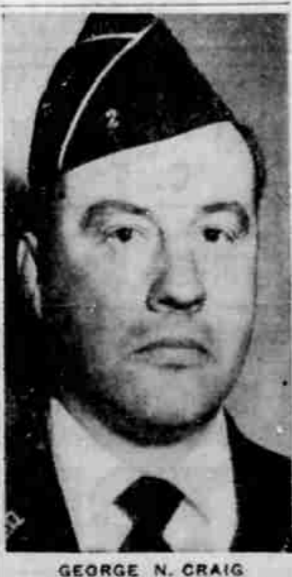
GEORGE N. CRAIG American Legion Choice

PHILADELPHIA, Sept. 2.—(AP)—The American Legion's new national commander—40-year-old George N. Craig of Brazil, Ind.—stood pledged today to make that organization "an important voice in the nation's political and social life."