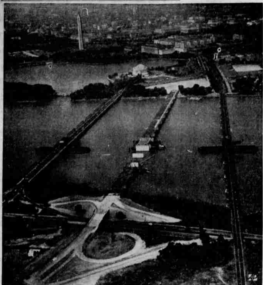
WASHINGTON BRIDGES —The new Washington 14th Street bridge is seen from the Virginia side between older bridges. Cloverleaf at bottom will channel traffic to Mt. Vernon Highway.