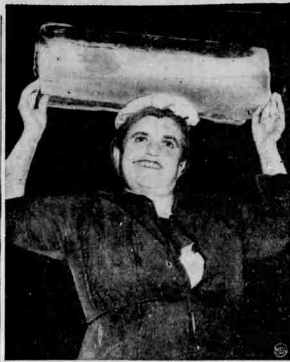
USING HER HEAD —If the heat bothers you, take a tip from this Italian woman. She's carrying home a 50-pound cake of ice during a blistering heat wave in Rome. That's the logical place to carry the stuff, as most Roman women use their heads to tote heavy loads.

The 11 defendants are charged with conspiring to advocate such steps.