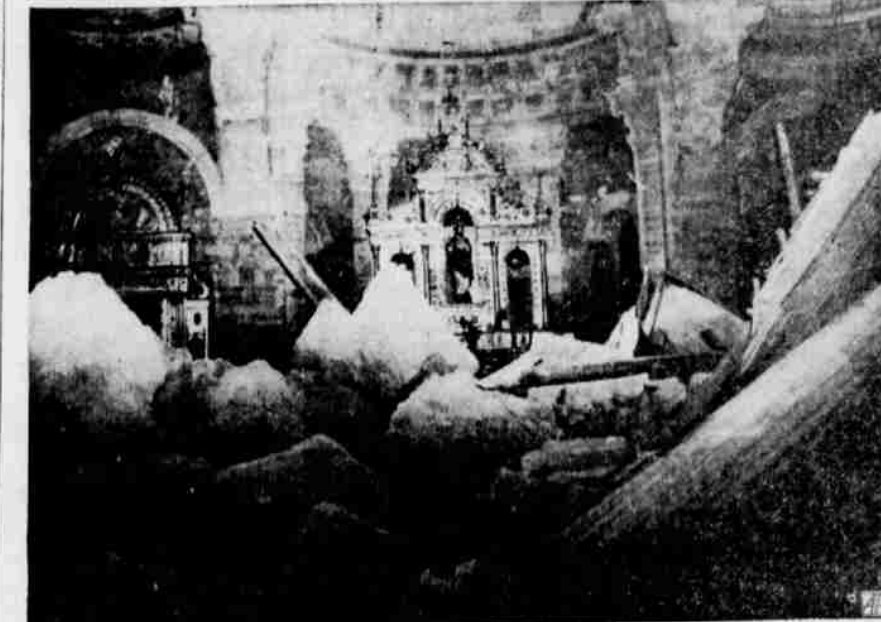
WHERE HUNDREDS DIED —This cathedral at Ambato, Ecuador, collapsed in the earthquake, killing an estimated 200 persons, mostly children. Most of the remaining homes in Ambato must be torn down. A spokesman for the president said the government had not been able to compile a death list, but estimated that the toll was between 2,000 and 4,000.