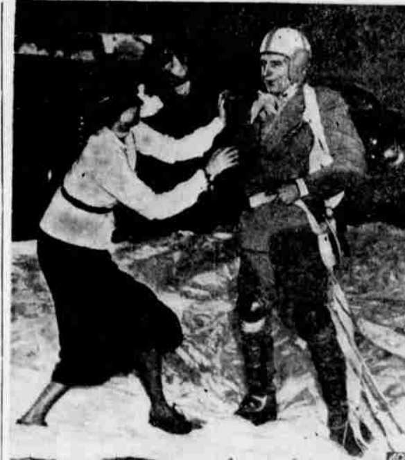
HAPPY LANDING —Bernarr McFadden, 81-year-old physical culturist, is greeted by his wife in a hayfield near Dansville, N. Y., where he landed hard but uninjured after his first parachute jump. McFadden said he wanted to prove that growing old is nonsense.

The committee said 12,000 signatures had been filed and estimated petitions still in the hands of volunteer workers had another 13,000 names. A total 30,528 eligible names are required.