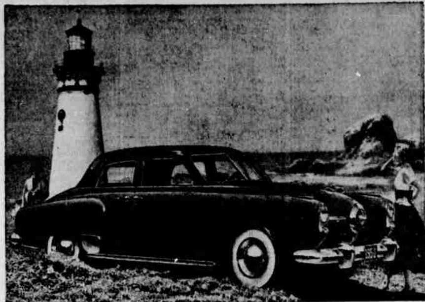
NEW STUDEBAKER MODELS ON DISPLAY —Two of the new 1950 model Studebaker cars, with airplane-styled front end and fender treatment, went on display in Roseburg today. One car is being shown at the fairgrounds and the other at the display rooms of the Keel Motor Co.

New 1950 Studebaker passenger cars went on display in Roseburg today. The Keel Motor Co. is exhibiting two models, one at the fairgrounds and the other at the company's display rooms at Jackson and Court streets. New models contain many improvements, says Vernon Keel, local agent. Compression in both engines—Champion and Commander—has been raised from 6.5 to 7.0, which steps up power and helps gasoline economy without making it necessary to use premium