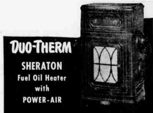
DUO-THERM SHERATON Fuel Oil Heater with POWER-AIR

You save up to 25% on fuel bills with DUO-THERM'S Power-Air Blower. Proved in actual tests in a cold northern climate. Keeps heat on the move... saves as much as one gallon in four and at the same time eliminates the problem of hot ceilings and cold floors. Another exclusive DUO-THERM feature.