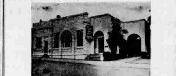
Roseburg Funeral Home

PROMISE YOURSELF: To forget the mistakes of the past and press on to greater achievements of the future.