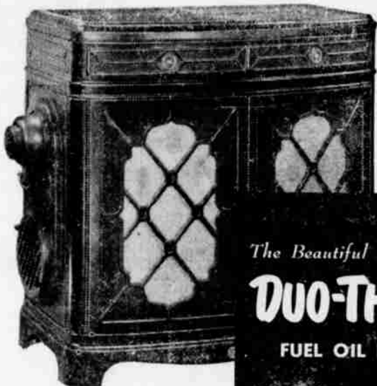
The Beautiful Hepplewhite DUO-THERM FUEL OIL HEATER

There's classic beauty in every line of this console model DUO-THERM heater. Patterned after the true beauty of period furniture in a lustrous mahogany finish that captures the beauty of real wood finishes. Its superb performance can bring a new high in heating comfort to your home. Radiant doors (both front and sides) give instant spot heat when you want it. All the famous DUO-THERM performance features are included.