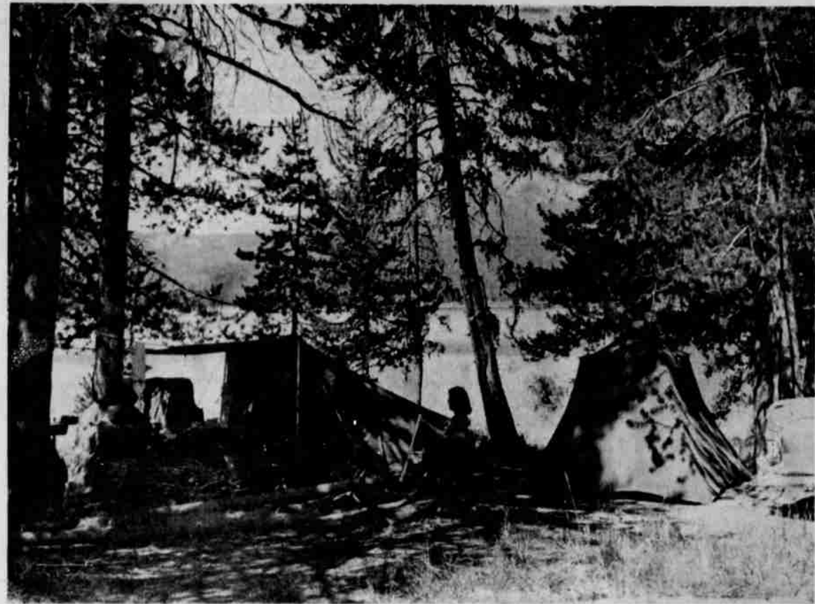
A "MODEL" VACATION—Here the models rest gratefully in camp on the peaceful shores of Diamond lake, after a gruelling day in the field. "After this," they suggest hopefully, "let's take pictures of living room fireplaces, or lawn swings." Not many campers are staying at Diamond lake now. The mosquitoes are many, the fish few. But even so it is a wonderfully restful spot for those who love it, to be lazy in.