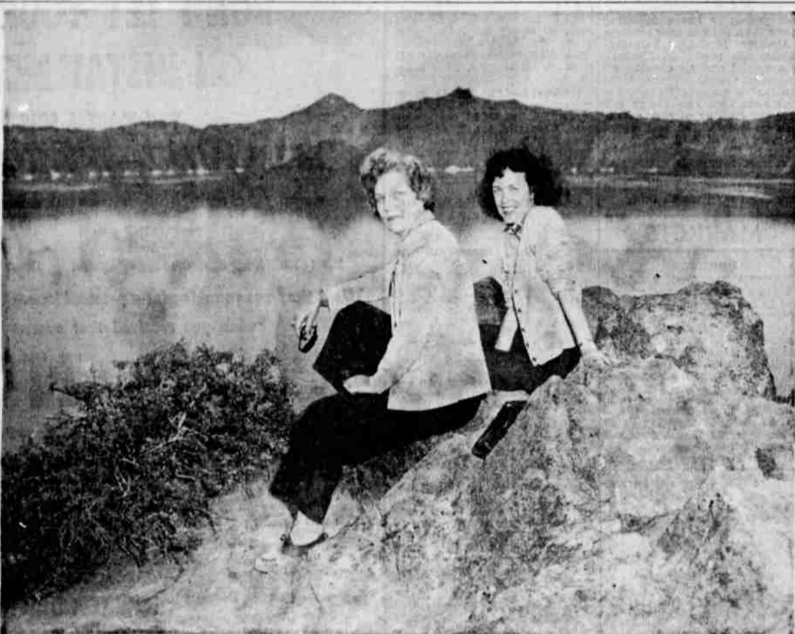
A "MODEL" VACATION—Distracted for the moment from viewing the wonders of Crater lake by the greater spectacle of the photographer's descent of a tricky trail on Sentinel Point, these two models were among the more venturesome who visited the magnificent viewing station at this spot. Wizard Island may be seen dimly in the background.