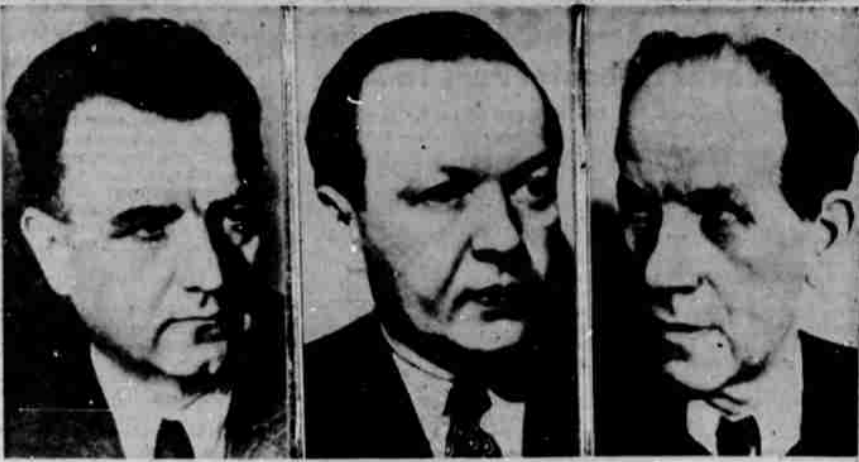
OPPOSE CATHOLIC CHURCH —Czech leaders united in their determination to destroy the power of the Catholic Church in Prague. They are (left to right): President Klement Gottwald; Minister of Justice Alexej Cepika, who said that any one trying to enforce the Vatican order excommunicating Communists would face treason charges; and Premier Antonin Zapoteky, who called for "law and justice" to be enforced against Archbishop Beran.