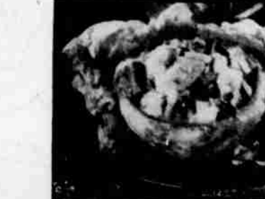
WEDNESDAY—Chicken Salad Pies! Crisp, flaky cheese-flavored tart shells filled with savory, flavoring chicken salad. Use pastry dough stored in refrigerator to make these tart shells and, at the same time, a pie shell for Thursday.

Yours For The Asking! Recipes for these 4 tasty treats—plus additional pastry making pointers. Gives you complete instructions for this time-saving pastry method (designed especially for Drifted Snow Flour) plus recipes for all the tasty treats illustrated. Look for the Martha Meade Pastry Method Folder at your grocer's, or write Martha Meade, Sperry Flour, San Francisco 6, Calif.