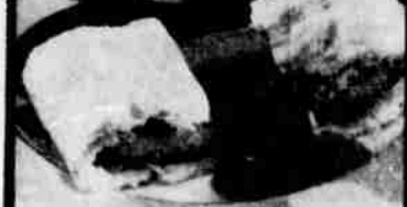
SATURDAY—Wieners In A Blanket! Hearty main dish that's easy on the purse. And while these wieners-in-pastry are in the oven it's a good time to bake the pie shell for Sunday's dessert... a real time saver.

Guaranteed Baking Results Are Yours! Get perfect baking results the first time and every time you use this time-saving pastry recipe, or any Martha Meade recipe, with Sperry Drifted Snow "Home-Perfected" Enriched Flour... otherwise double the price of your sack of flour will be refunded. Write Sperry Flour, San Francisco 6, California. A pleasing variety of Martha Meade recipes are included in every sack of Sperry Drifted Snow Flour for your convenience. Next time you buy flour, insist on Sperry Drifted Snow Flour for successful baking results!