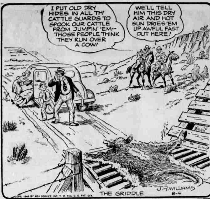
OUT OUR WAY