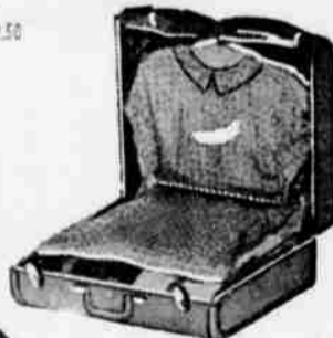
Ladies' Wardrobe, $25.00