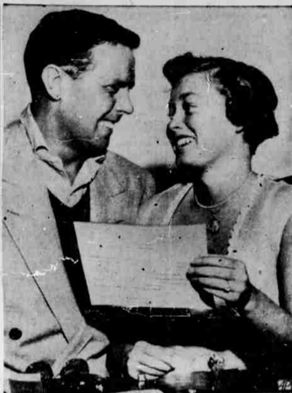
GET LICENSE — Crooner Dick Haymes and Nora Eddington Flynn, each recently divorced, seem to be enjoying the procedure as they take out a marriage license in Santa Monica, Calif. Haymes was formerly married to Actress Joanne Dru; Nora to Errol Flynn.