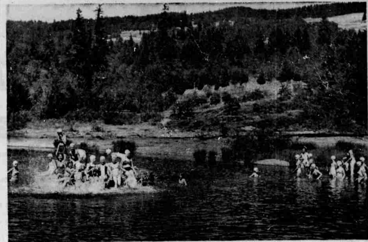
SWIMMING provides Camp Fire Girls at Camp Tyee one of their principal activities. Under the direction of Miss Leslie Clerin, water safety instructor, the girls are afforded an opportunity to cool off, as well as learn swimming under supervision. The facilities were improved this year by piping fresh water from further upstream into a natural backwater pool near the camp.