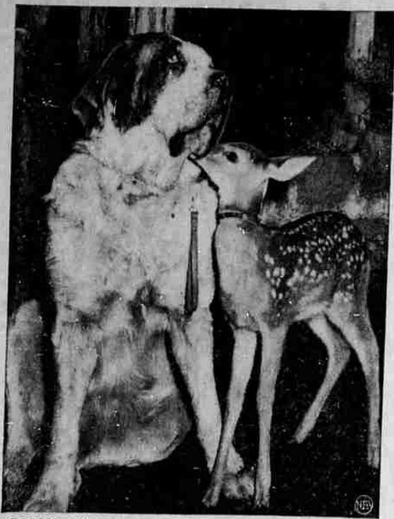
BOSOM BUDDIES —Jumbo, 5-year-old Saint Bernard, and Mabel, 5-week-old fawn, have become bosom buddies. Mabel's mother had wanderlust and abandoned her on a farm near Stockton, N. J., where Jumbo discovered her. The Saint Bernard's owner brought the young deer to a vet for treatment. But Jumbo got so lonesome for his new girl friend that Mabel was finally brought home again to keep him company.