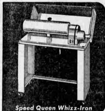
Speed Queen Whizz-Iron

A genuine, full-size Speed Queen... built by Speed Queen... and guaranteed by Speed Queen. It will wash your clothes clean and serve you faithfully for many, many years. Fast-washing agitator type.