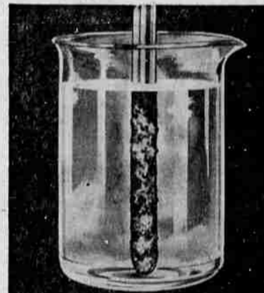
RUSTED IN ORDINARY GASOLINE

This steel rod is heavily coated with rust after special 48-hour laboratory test in ordinary gasoline containing a small amount of added water. Rust also attacks the gasoline tank and fuel system of your car.