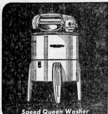
Speed Queen Washer

Many washers ALONE cost more than $200. Many ironers ALONE cost over $200. But here — for even less than $200 — you can buy BOTH a washer and ironer and get genuine Speed Queen quality besides. It's the biggest complete laundry outfit bargain we've been in a position to offer!