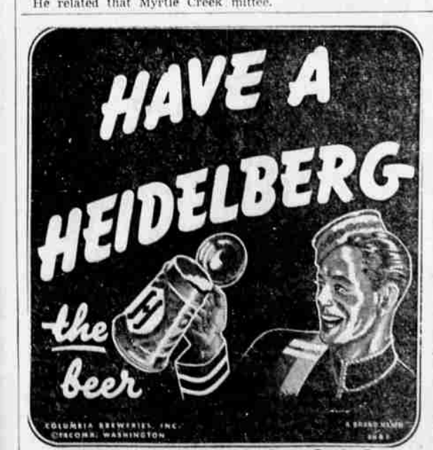
Distributed in Roseburg by Bates Candy Co.