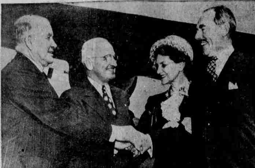
ACHESON RETURNS FROM BIG FOUR MEET —Secretary of State Dean Acheson and his wife, (right), returning from the Big Four Foreign Ministers meeting in Paris, are greeted by President Truman and Vice President Alben Barkley on the arrival at National Airport in Washington.