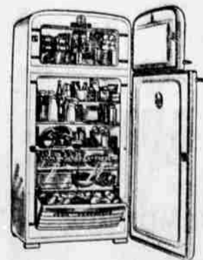
MODEL TM . . . 11 cu. ft. over all capacity yet it takes no more floor space than the 8.6 cu. ft. models. 80-lb. capacity in the freezer shelf. Powered by the famous Polarsphere unit.

$3900 DOWN $4.25 per Week Full price $389.95 28 Pkgs. of frozen foods FREE