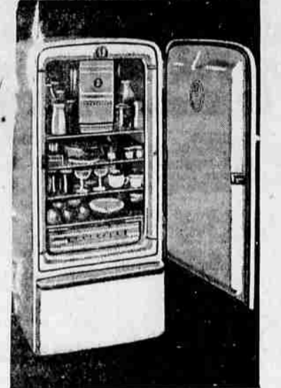
MODEL CR . . . Luxury Features at an economy price. 17-lb. High-Speed Freezer! 20-qt. Vegetable Crisper! Big aluminum chilling tray. Full 6 cu. ft. of storage! Powered by Kelvinator's famous, penny-pinching Polarsphere. A miracle of value in this Kelvinator!

You can save money by buying a famous Kelvinator refrigerator or home freezer now. Until this Saturday evening, we will fill the freezer shelf of every Kelvinator refrigerator with an assortment of tasty Pict-Sweet frozen foods. With every Kelvinator home freezer, we will give you 50 packages of frozen foods . . . all FREE. Part of your small down payment will actually be buying food for your family . . . it's an advantage that only MODERN FURNITURE COMPANY is offering you. Come in before Saturday night and take advantage of this liberal offer . . . see the whole KELVINATOR line. See the most advanced refrigerators and home freezers in the refrigeration line . . . you'll be glad you did.