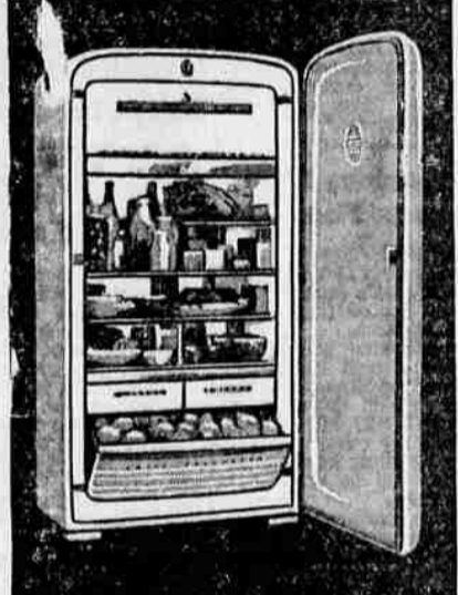
MODEL FM . . . An engineering Masterpiece! 50-lb. Frozen Food Chest. Magic Shelf adjusts 5 ways—makes room for bulky foods. Twin sliding Vegetable Crispers (20 qt. total capacity). 8 1/2 cu. ft. in shelf area, plus 1 1/2 cu. ft. in Fruit Freshener Zone.

$2000 DOWN $2.25 per Week Full price $199.95 9 packages of frozen foods FREE