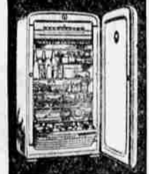
MODEL MM . . . Greatest food-keeping advance in years! 50-lb. Frozen Food Chest. Big general storage. Cold-Mist Freshener. New Fruit Freshener.

$3000 DOWN $3.50 per Week Full price $299.95 20 Pkgs. of frozen foods FREE