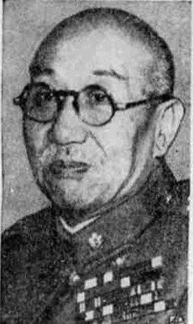
CHINA'S PREMIER —Marshal Yen Hsi-shan (above), "last of the war lords" of another era, was appointed Premier of Nationalist China by acting President Li Tsung-jen.