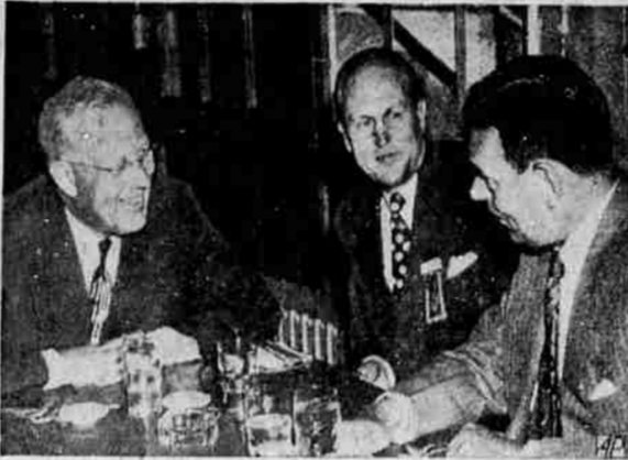
GOVERNORS' HUDDLE —Three Republican governors dined together during the governors' conference at Colorado Springs, Colo. From left to right are Earl Warren of California, Arthur B. Langlie of Washington and Thomas E. Dewey of New York.