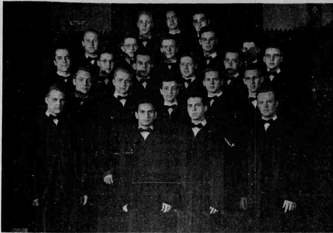
The Lutheran Hour Chorus, made up of students attending Concordia Lutheran Seminary at St. Louis, Missouri, will be presented in a sacred concert at the Roseburg Senior High School Thursday night, June 23, at eight-fifteen o'clock. The Chorus is heard every Sunday morning over the Mutual Broadcasting System on the Lutheran Hour, with Dr. W. A. Maier as speaker.