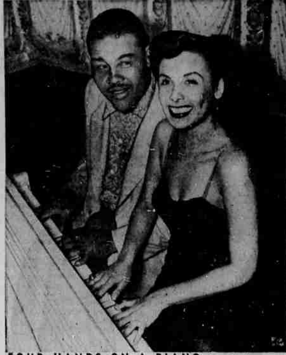
FOUR HANDS ON A PIANO —Joe Louis, retired world heavyweight boxing champion, joins Lena Horne, entertainer, at the piano in a Chicago night club where she is appearing.

Topping the pitchers was Vic Raschi of New York with a 9-1 mark for a .900 percentage. Detroit's Virgil Trucks took strike-out honors with 70.